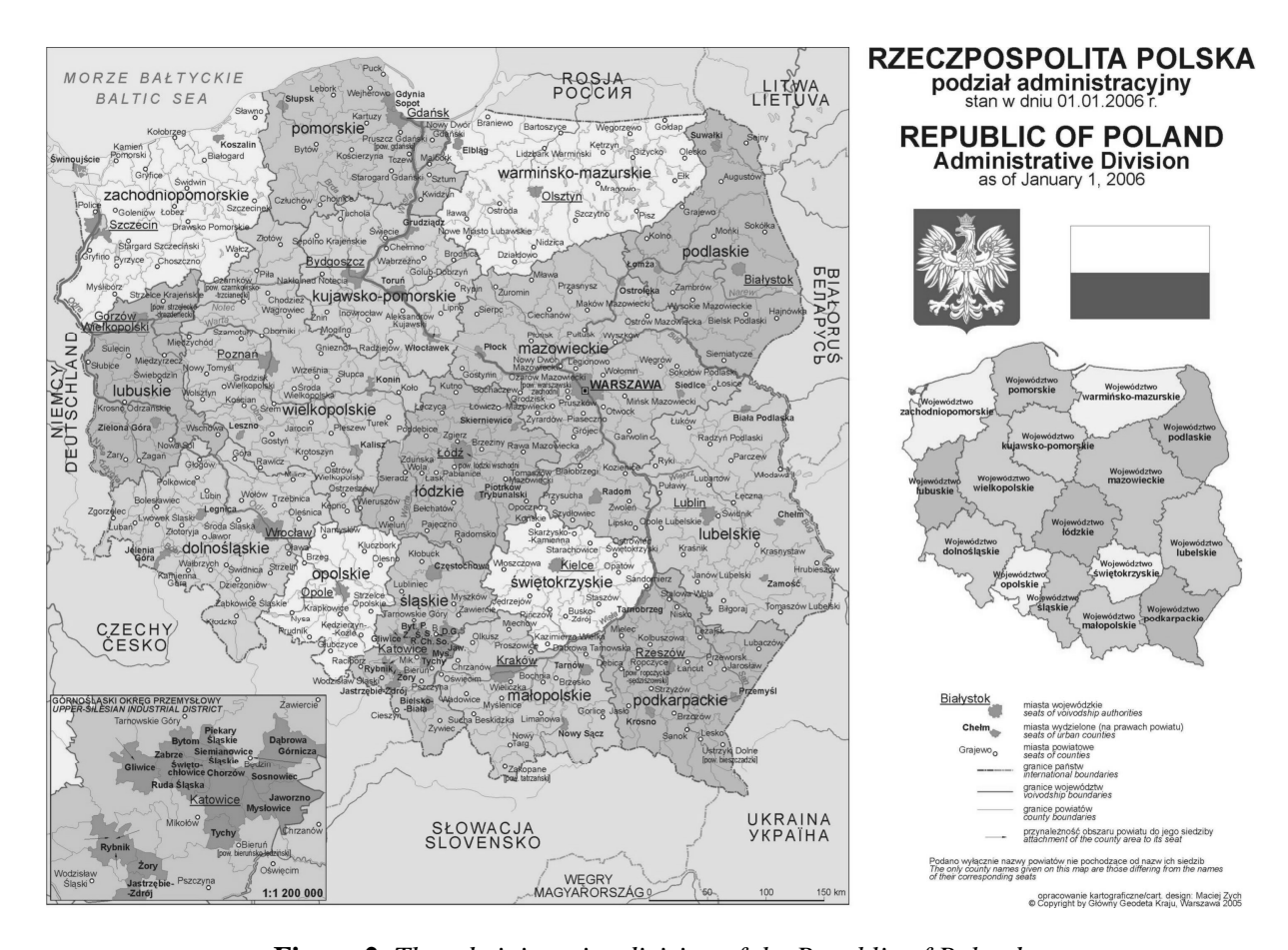
Figure 2. The administrative division of the Republic of Poland.