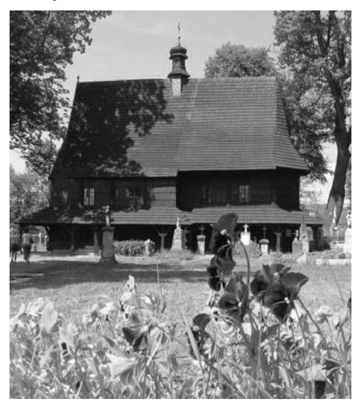
Figure 3. Wooden church in Lipnica Murowana.

The main goal of Program's formulation is the aspiration for the significant improvement of the state of regional cultural heritage collections, as well as for the preservation of Malopolska cultural landscape, through the determination of basic conditions and organizational, financial, and educational determinants that serve for this protection. In addition, the Program is to care for the rational use of cultural heritage collections.