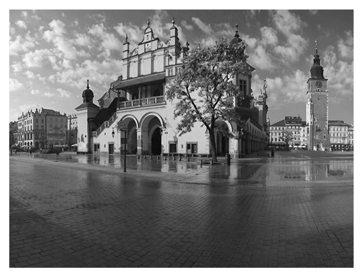
Figure 4. Market Square in Krakow.

Not only monuments constitute the heritage of Malopolska, it is also the culture of the region—craft, folk customs, traditions, folklore, cuisine, and unique landscape, different from the rest of Poland. The need for the protection of native heritage is indisputable and is carried out with a great success by many institutions: central, self-governmental, social, or even private.